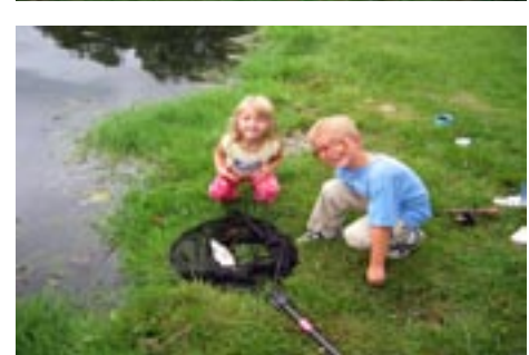
Twenty nine kids and twenty nine adults had a great time "on the pond", after a morning presentation of Ozzie's video "Not Just Trout". Pizza lunch too!